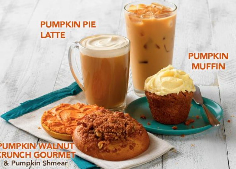
PUMPKIN PIE LATTE