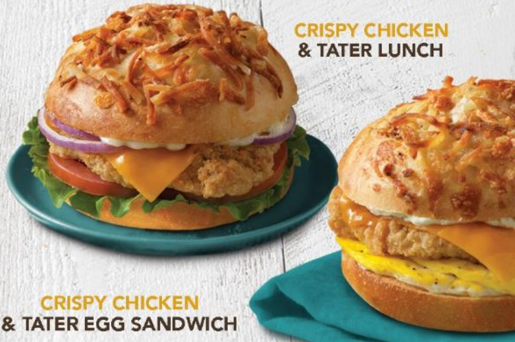
CRISPY CHICKEN & TATER LUNCH