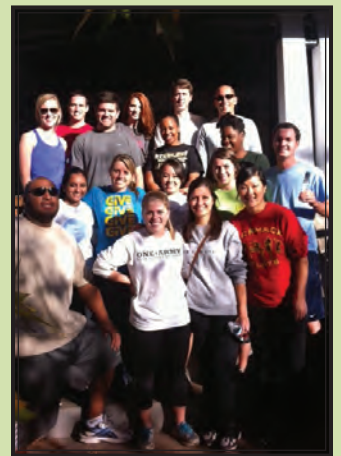
Class 49 working at Glenwood