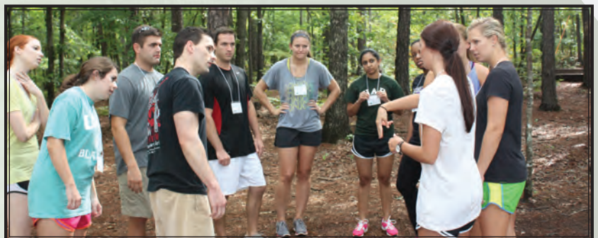
Team building through low ropes course