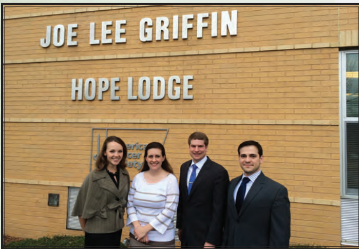
MSHA Classic Officers with Hope Lodge Executive Director