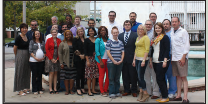
Members of Class E49 Finishing First On-Campus Session

Policy Director Louisiana Dept. of Health & Hospitals Baton Rouge, LA