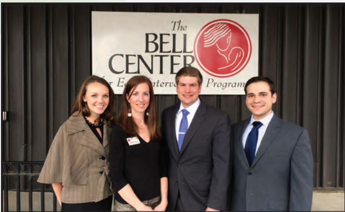
MSHA Classic Officers present check to The Bell Center