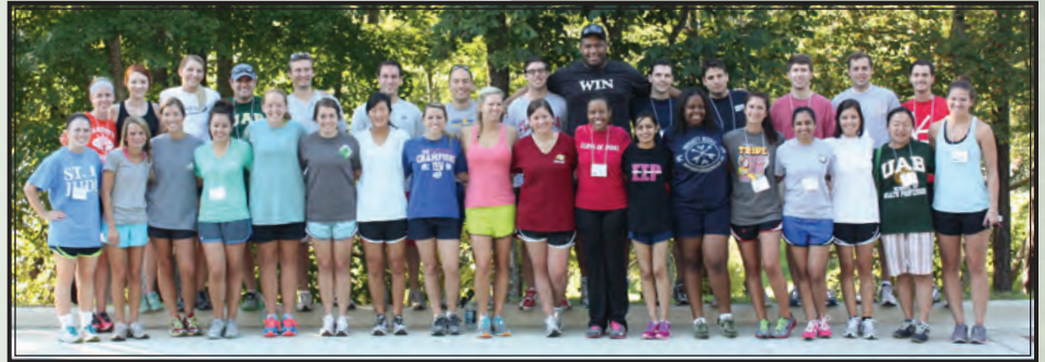
Class 49 completes Alabama 4-H Orientation