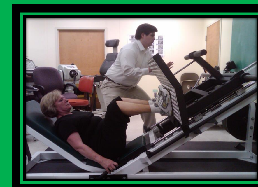
Leg and hip strength as well as stretch-shortening cycle ballistic leg press evaluations.