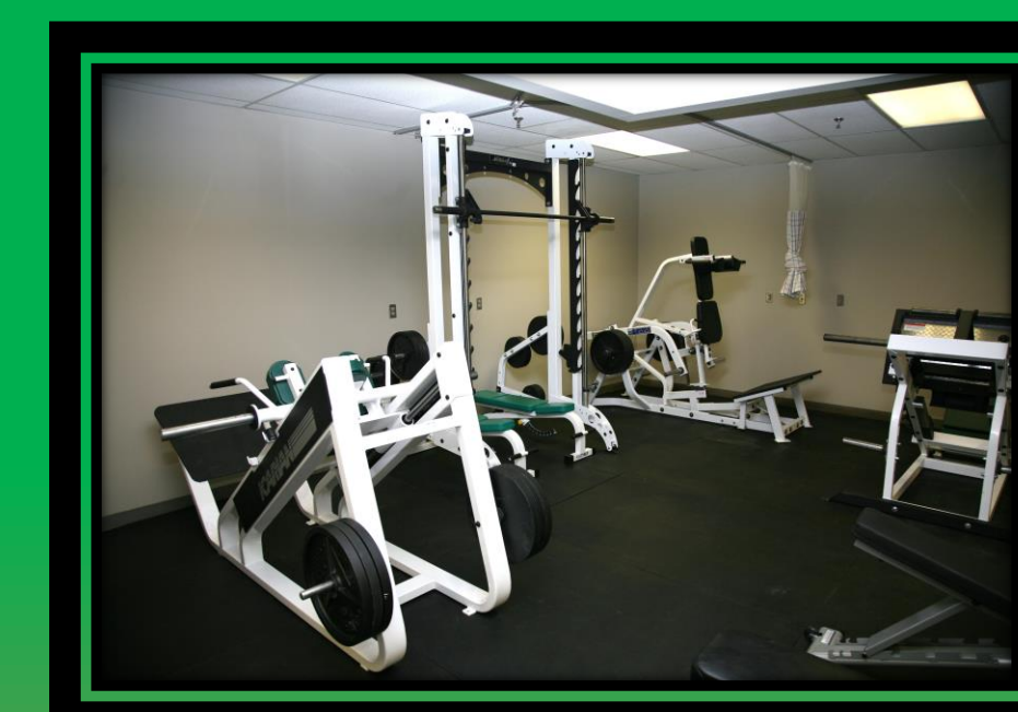
We offer training programs designed and tailored to meet personal strength and weight-loss goals and we assist in the development of experimental protocols