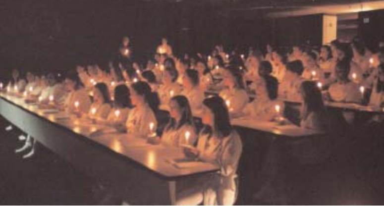
Students hold lighted candles during the Lamp of Learning ceremony.