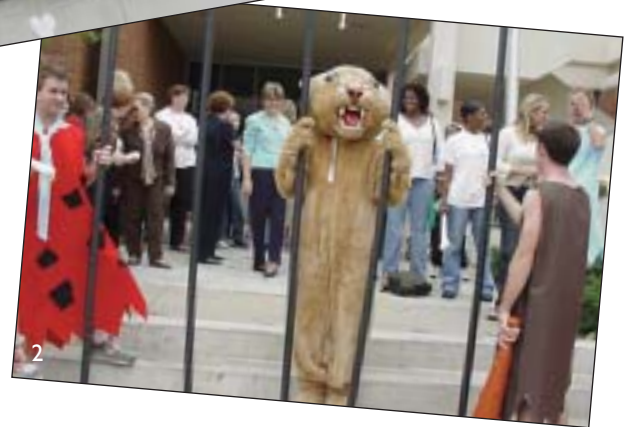
1. & 2. Caging the Cougars at the Nursing Building