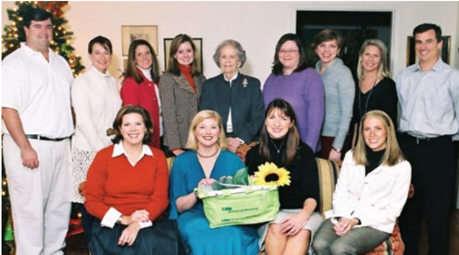
The UABSON Junior Board of Visitors