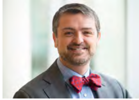
Eric Wallace, MD

On November 14 th , testified to the US Senate Committee on Finance, Subcommittee on Health, on establishing a permanent telehealth rule to ensure permanent access to patients across the country.