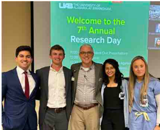
Huntsville Campus Research Day, 2024

A variety of resources and services are available to UAB students and employees that contribute to the overall safety and security of the campus, reducing the success of criminals. Rave Guardian is a way to prove your personal safety and protect your friends by building your own private safety network. This free app provides instant communications with friends, family, co-workers, and even 911 in the event of an emergency. The app can be downloaded from the Apple App Store and Google Play Store. See https://www.uab.edu/emergency/rave-guardian for more information regarding Rave Guardian.