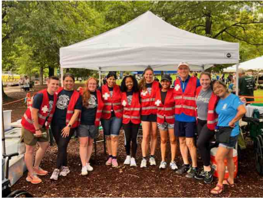
Medical Tent at Cotton Row Run, May, 2025

commitment to the safety of the community. Following is a list of resources you can use to help create a safe campus for yourself and others.