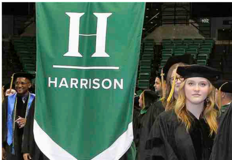
Harrison Learning Community Banner at UAB Graduation

For the Huntsville Regional Medical Campus, SEI assists in maintaining a Daily Crime Log that records, by the date the incident was reported, all crimes and other serious incidents that occur on the HRMC campus, on public property, or within the department's patrol jurisdiction. Copies of the Daily Crime Log will be provided to the HRMC Executive Administrator on the day that the crime or serious incident occurs, or the following business day if the crime or serious incident occurs during a holiday or weekend hours. It is our policy to prepare a disclosure of crime statistics via our Annual Security Report, our Daily Crime Log, and on the HRMC intranet and website. The Daily Crime Log will be available for public inspection upon request at the HRMC Regional Dean's Office. The Daily Crime Log will include the nature, date, time, and general location of each crime reported to the SEI security officer, as well as the disposition of the complaint, if this information is known at the time the log is created. All incidents occurring on the HRMC as posted in the Daily Crime Log will be recorded on the Huntsville intranet. HRMC and SEI reserve the right to exclude reports from the log in certain circumstances.