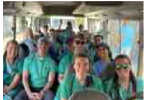
Medical Mission trip to the Dominican Republic

The term ongoing awareness and prevention campaigns refers to campaigns that are sustained over time focusing on increasing awareness or understanding of topics relevant to SA, DoV, DaV and stalking prevention. These programs will occur at different levels throughout the institution (i.e. faculty, athletics, and incoming students) and will utilize a range of strategies. Ongoing awareness and prevention campaigns may include information about what constitutes sexual assault, dating violence/intimate partner abuse, and stalking, changing social norms, promoting recognition of perpetrator tactics, enhancing understanding of consent, and advancing prosocial behaviors of individuals and communities. Effective ongoing awareness and prevention campaigns will include developmentally appropriate content for the specific audience and their knowledge and awareness level and provide positive and concrete ways for individuals to get involved.