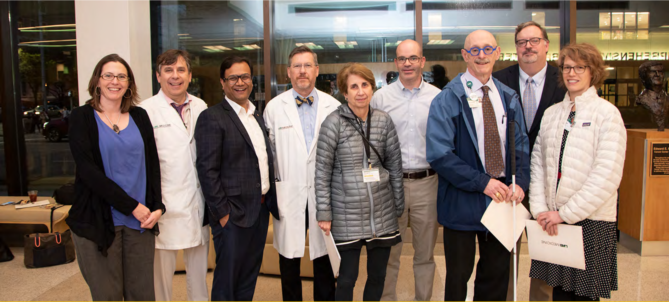
Top Box Docs! Department of Medicine Physicians with Excellent Patient Communication Honored at Reception