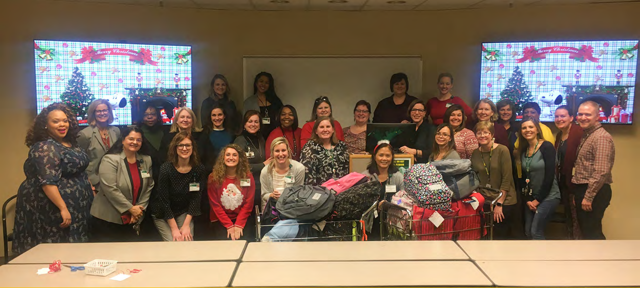
Program Coordinators provide 30 backpacks for kids in need at the DHR Bessemer Office