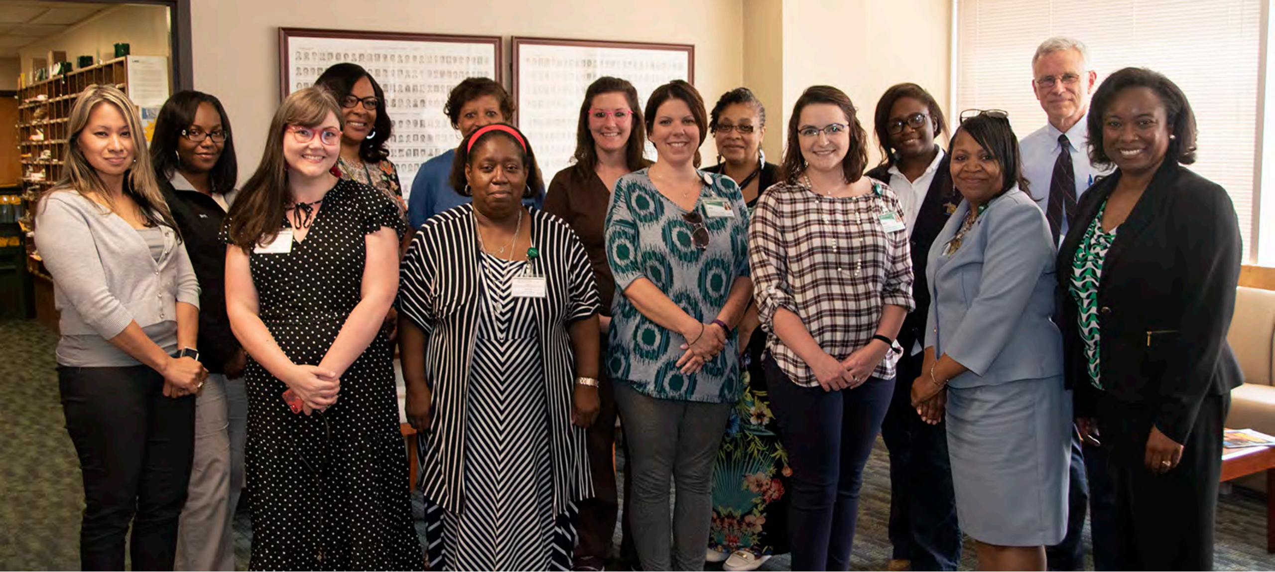
Team DOM Celebrates Sweet Success at 2019 SOM Diversity Fair Department of Medicine took second place in the “culinary competition” for the second year in a row