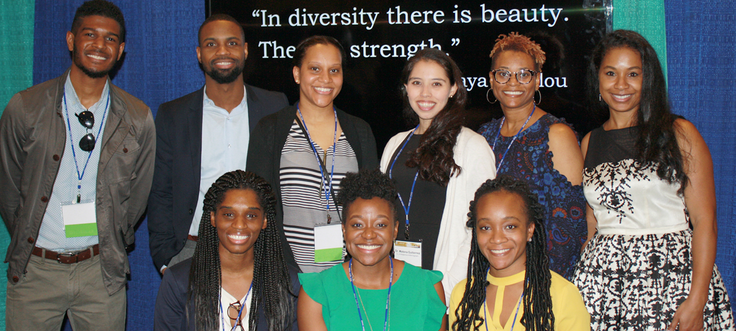
Graduate Medical Education Team Visits Student National Medical Assn. Internal medicine faculty and residents joined forces with other GME departments for recruitment of trainees who are underrepresented in medicine.