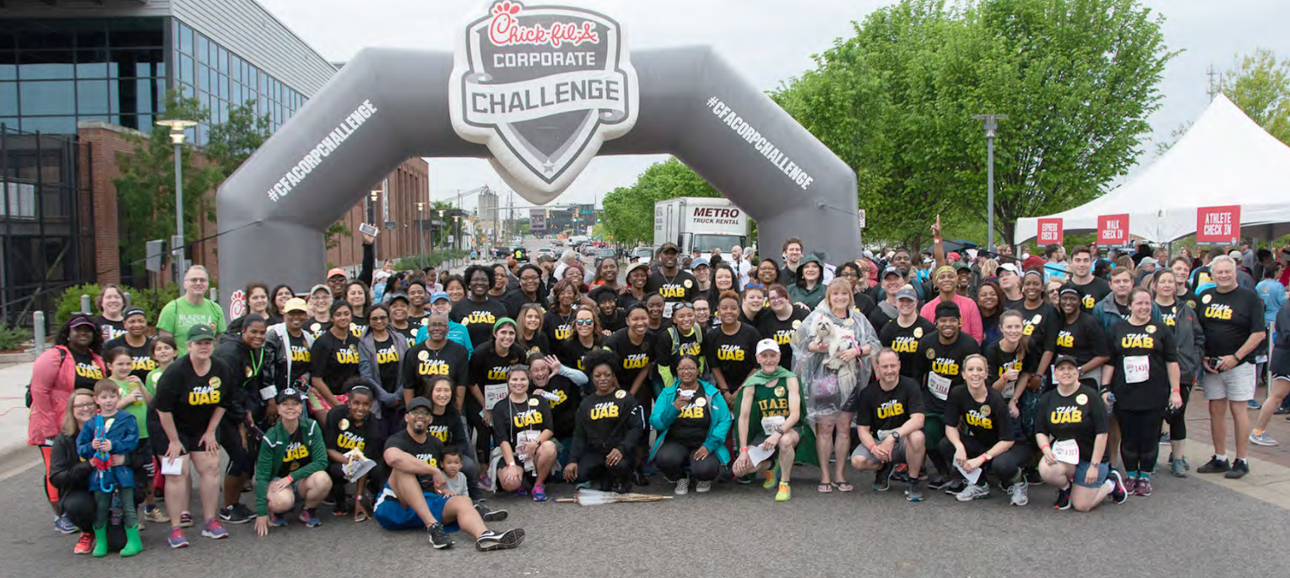
UAB Walks for Fun and Fitness at B'ham Corporate Challenge Department of Medicine's Dr. Well-Be Joins the Team to #WinAsOne at Region's Park