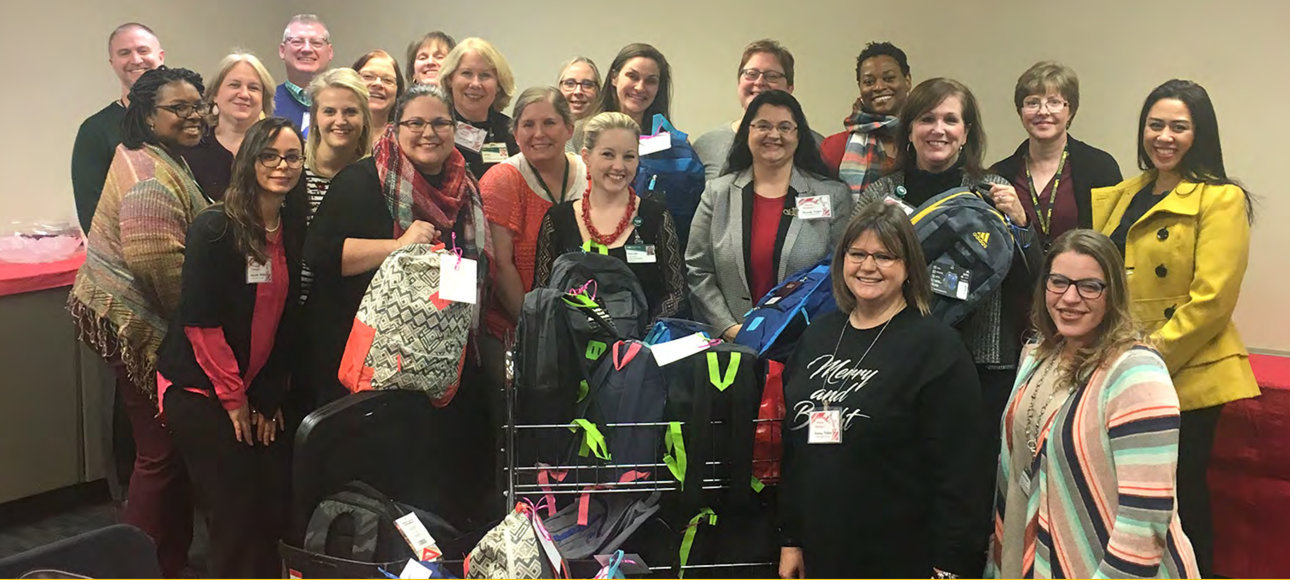
Program Admins & Coordinators Fill 25 Kids' Backpacks Holiday service project stuffs 25 backpacks for kids relocated to safer homes via DHR