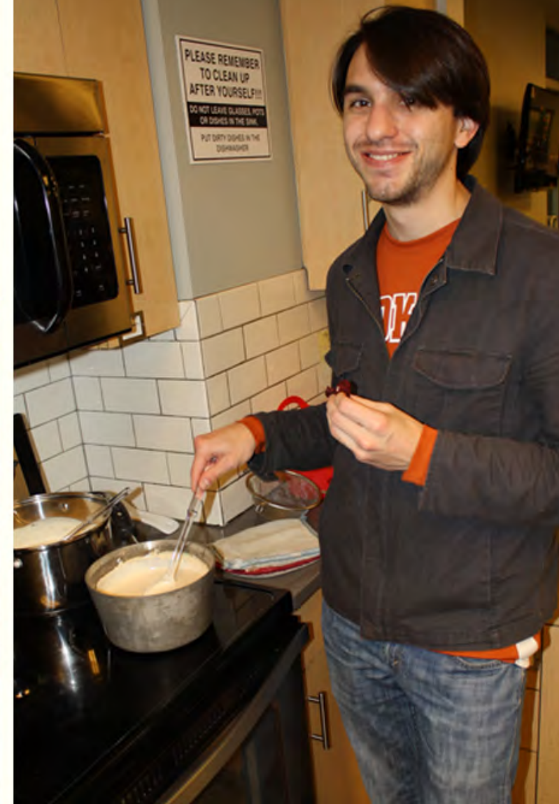
IM Residents Serve up Holiday Cheer at ACS Hope Lodge Providing a hearty meal for patients staying away from home during cancer treatment