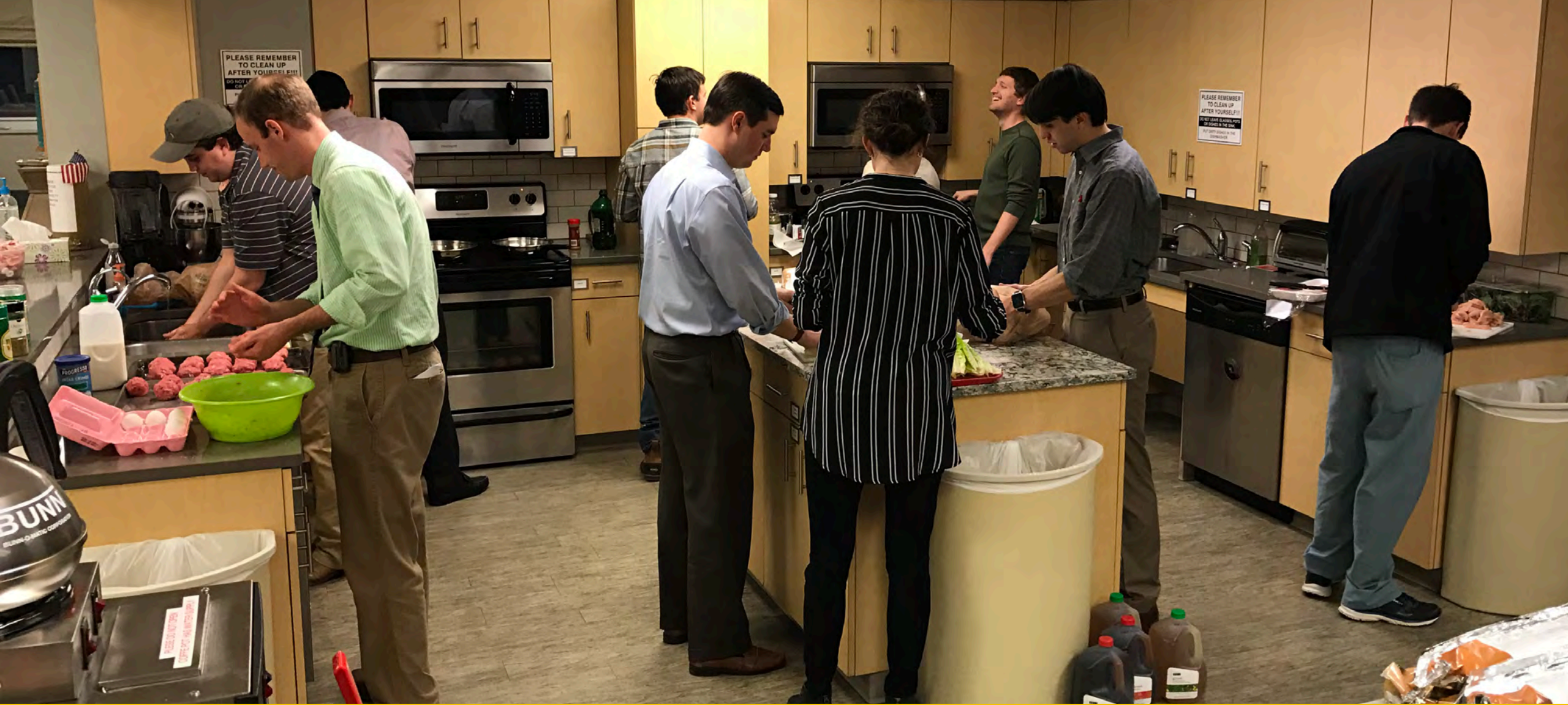
IM Residents Dish Up Spaghetti Supper at Hope Lodge Resident Wellness Committee offers opportunity to serve and support our community