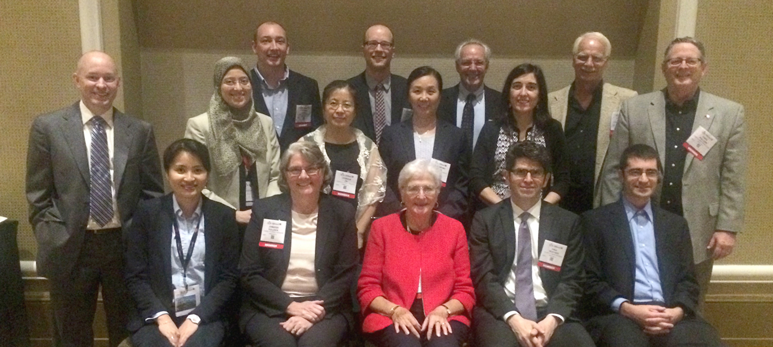
UAB Faculty Dominates American Heart Association Hypertension and Kidney Council Meeting