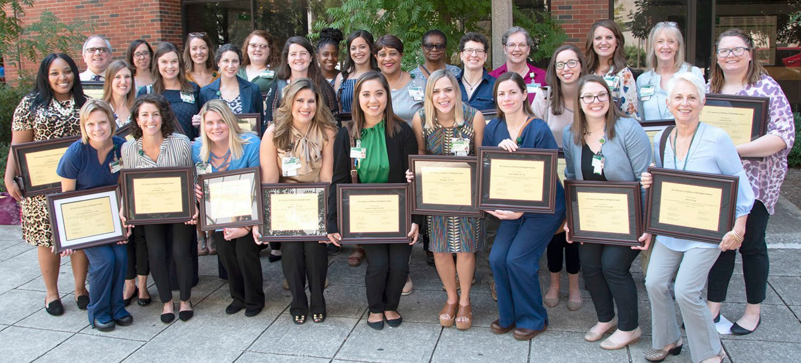
30 Interprofessional Geriatric Scholars Celebrate Successful Completion of the Program to Improve Geriatric Care at UAB