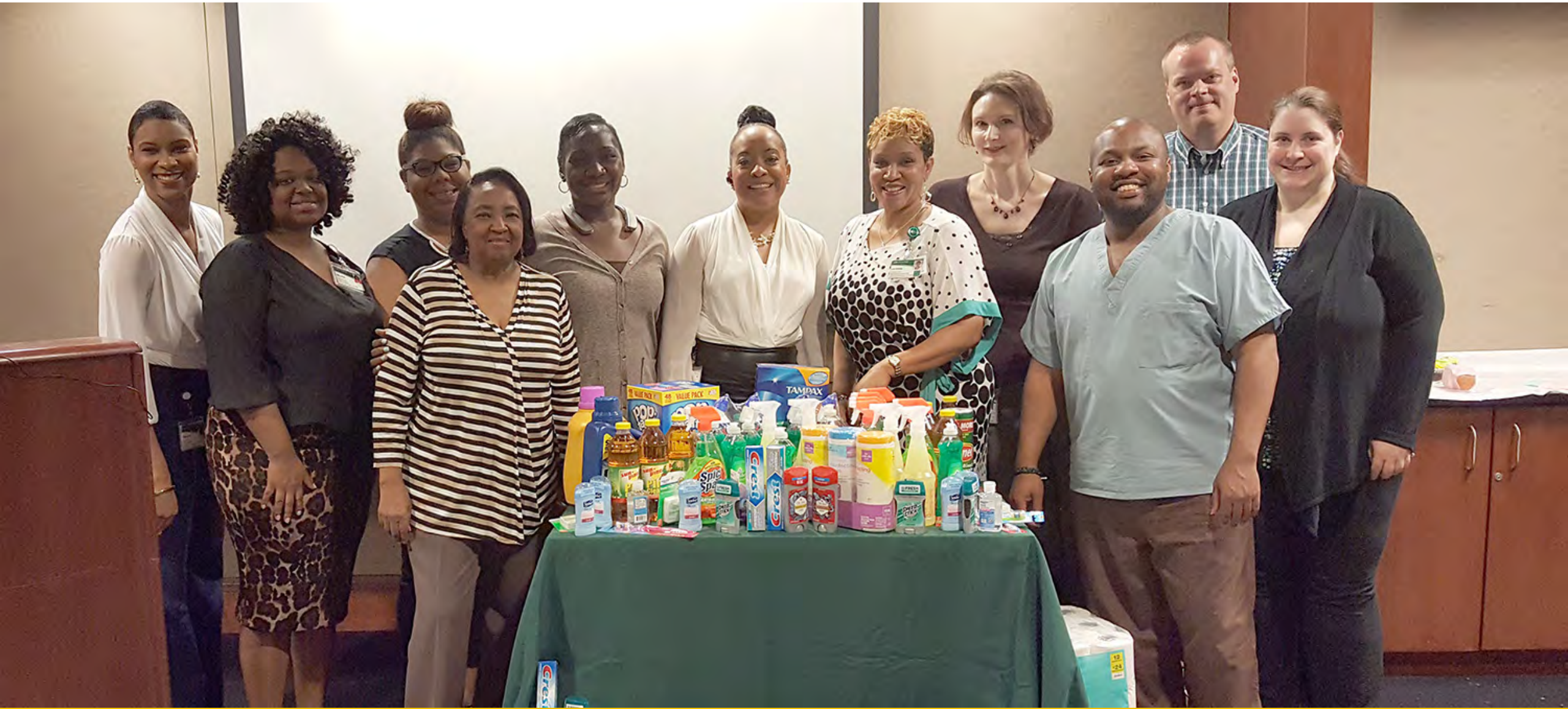
Hematology/Oncology Division Supports Blazer Kitchen Staff contribute dry goods and supplies to help those in need in our UAB Community.