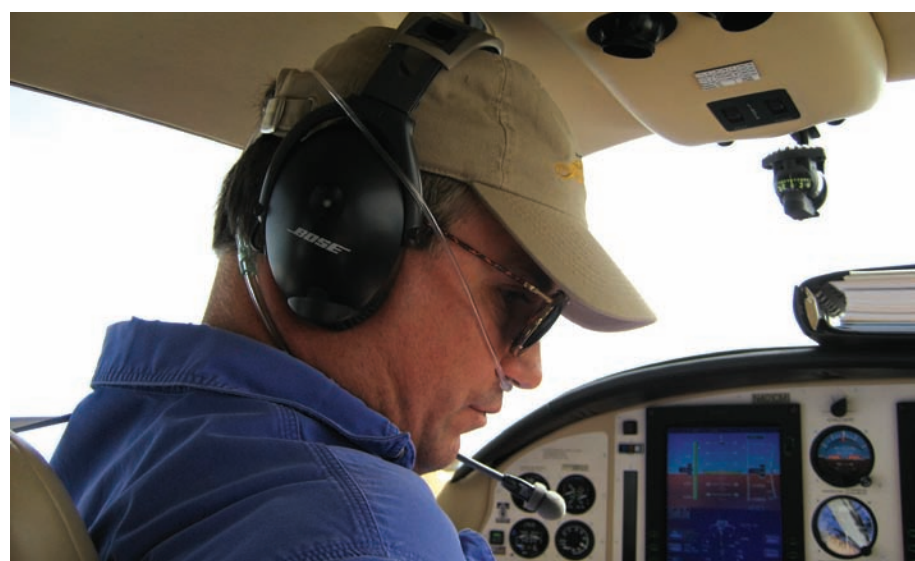
Shown here in the clouds and on oxygen in the Clark family Columbia 400.