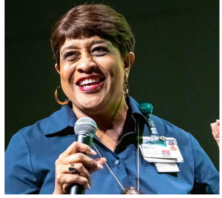
4th Annual Story Power Nov 30 // 12p