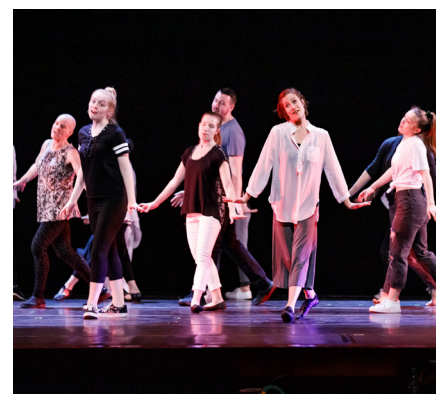
Healing Harmonies/Raising Our Voices Documentary Premiere Oct 29 // 6:30p