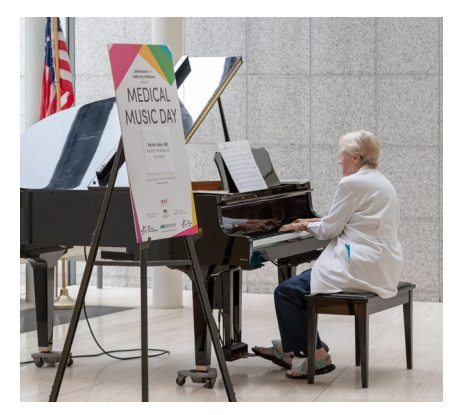
6th Annual Medical Music Day May 18 // 10a-4p

AIM brings the healing power of the arts to our community! We hope you'll join us for one of our many community events.