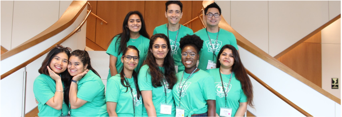
INTO UAB orientation leaders—all UAB international students themselves—prepare to greet new students.