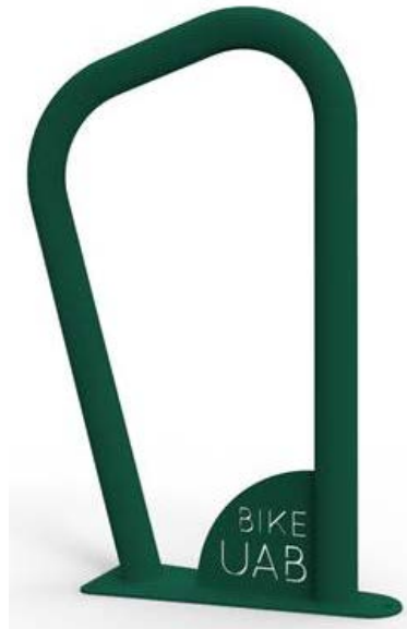
EXHIBIT – BIKE RACK