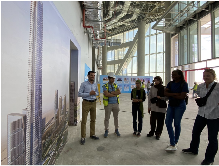
Students Visiting a NAC Building under Construction in Cairo.