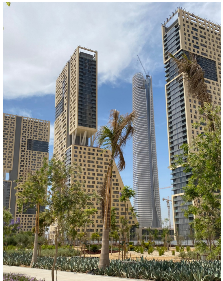
Completed Buildings in NAC of Cairo in Egypt.

Note: 1. To earn an AIU degree, students will need to complete a 3 credit hour capstone project for a total of 33 credit hours.