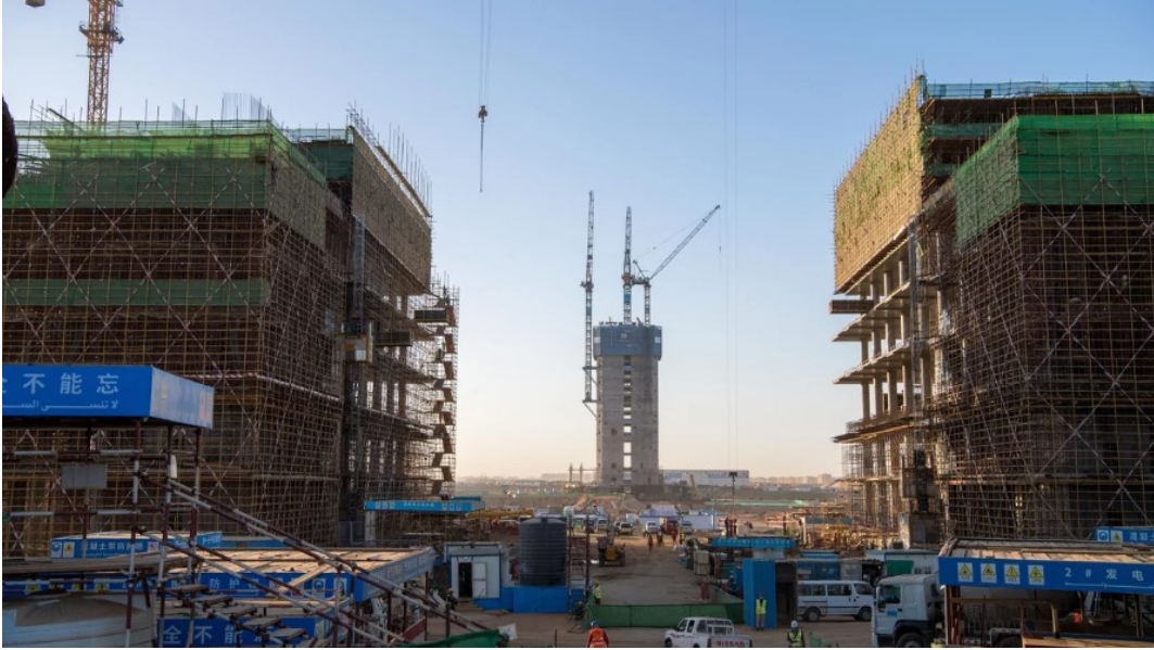
New Administrative and Finance Capital (NAC) of Cairo in Egypt.

1. Middle East and North Africa (MENA) region residency required