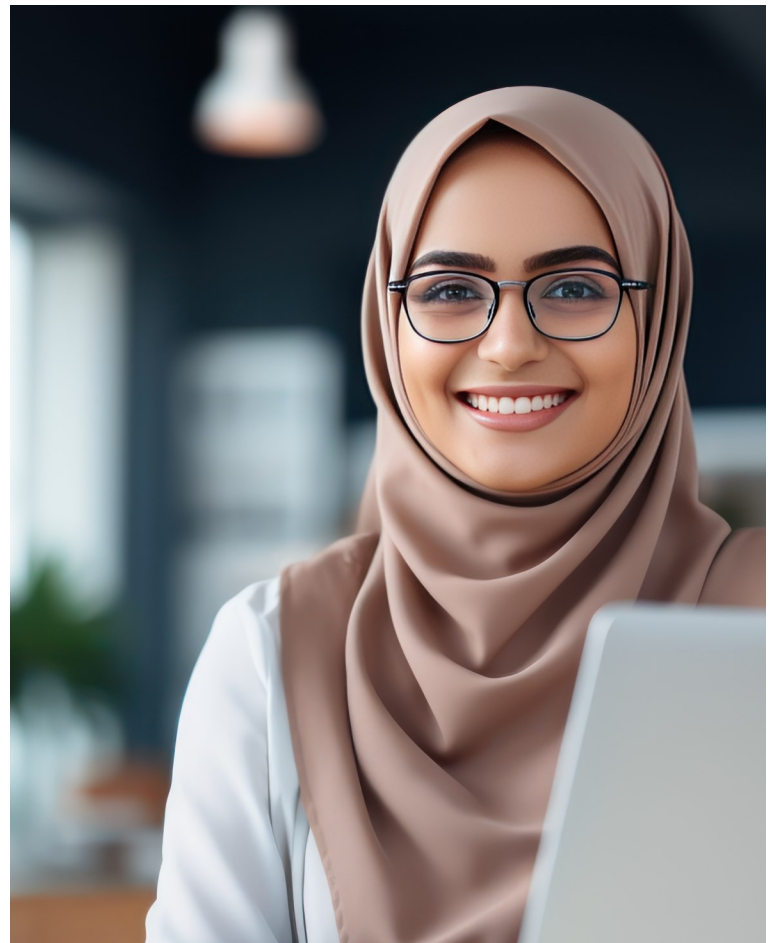
Student Participating in an Online Course.