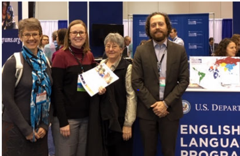
Planning International Exchanges with the U.S. Dept. of Education English Language Programs

Assistant Professor, English Learner Education