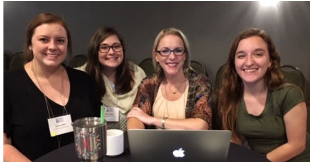
With IMPACT scholars