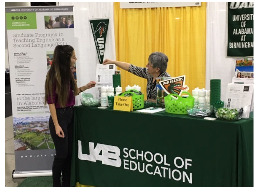
In the EdS-TESOL booth at the International TESOL Convention: Atlanta in March 2019