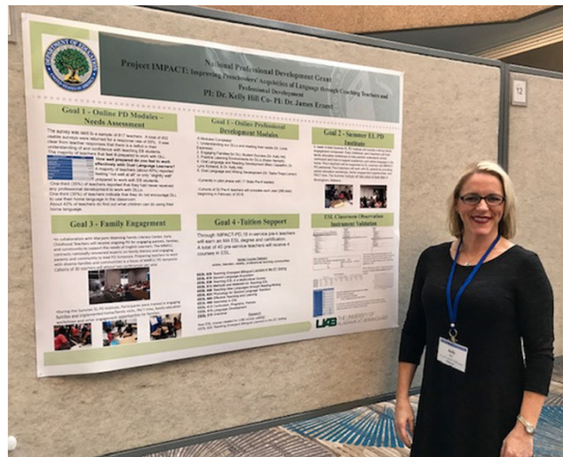
OELA meeting in DC

Assistant Professor, Early Childhood and English Learner Education