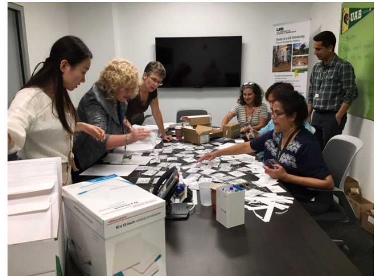
Preparing for the 2017 SETESOL Conference