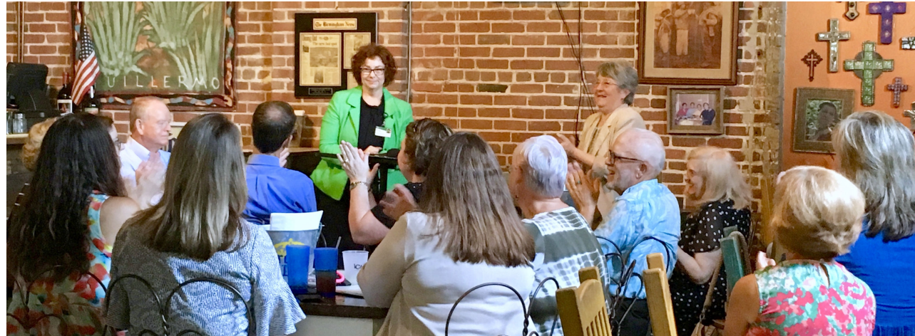
Showing recognition and appreciation for instructors, supervisors, and school partners of the ESL Teacher Education program (7/18/18)