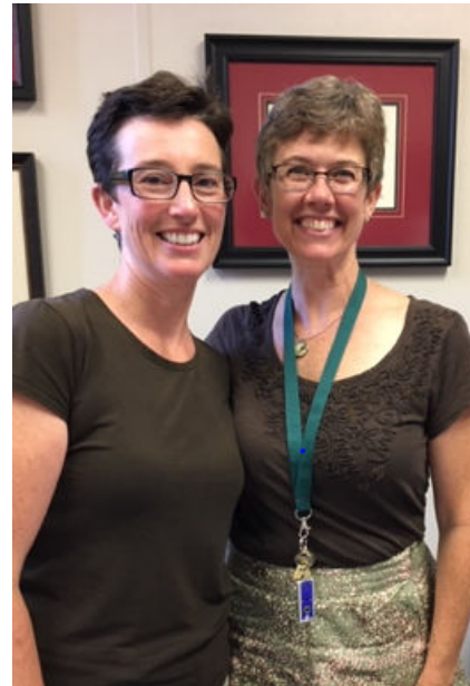
With a student from South Dakota