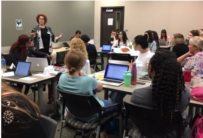
Speaking with the class “Teaching ESL in a Multicultural Society” (7/13/18)