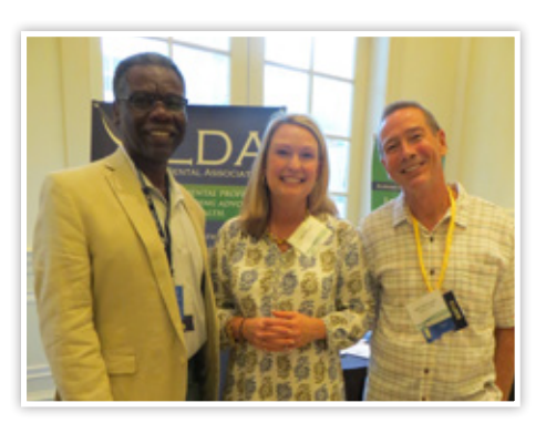
AGD DEAN'S RECEPTION SanDestin, FL