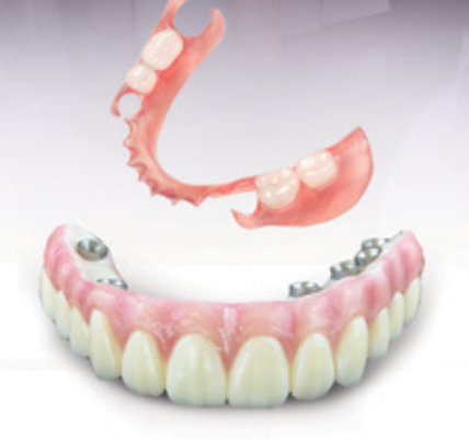
Fabricated by Oral Arts Technicians