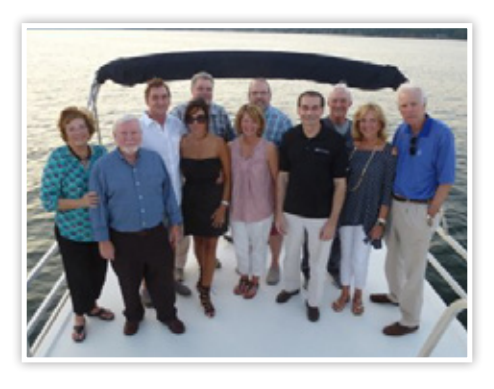
UNIVERSITY OF ALABAMA FOOTBALL TAILGATE