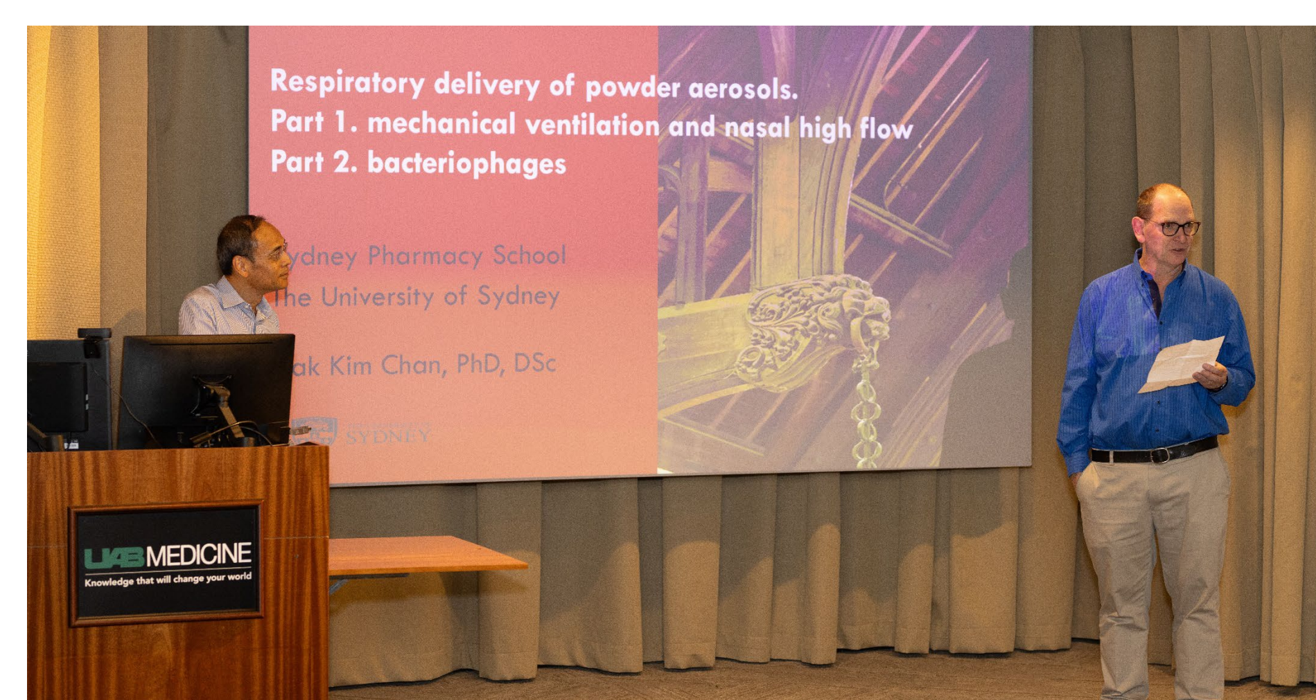
Pictured: Pulmonary Grand Rounds presentation