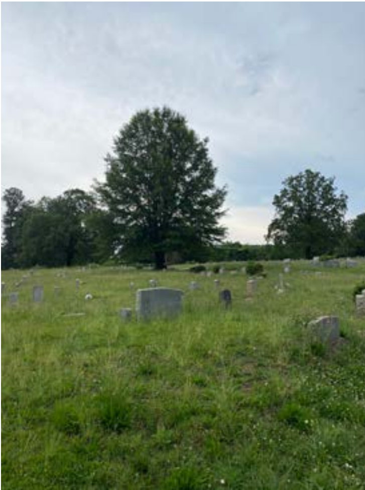
Shadowlawn Cemetery.