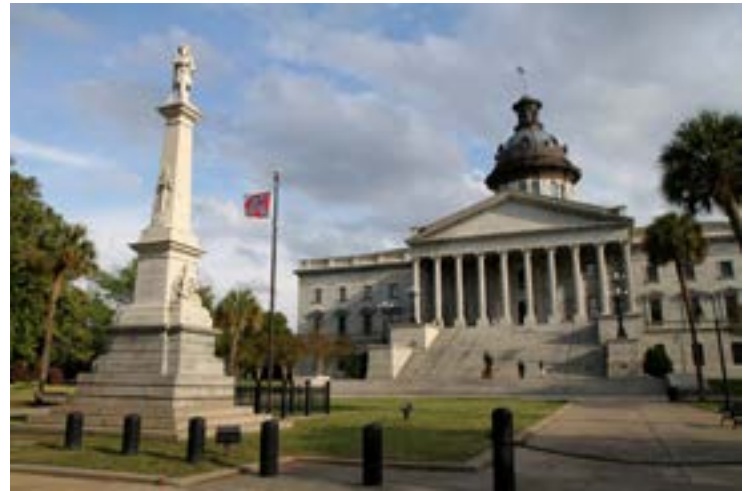
Confederate flag in Columbia, South Carolina.

scarlet, white and scarlet bars on the right two-thirds of the flag with the Confederate battle emblem." 17 Replacing the