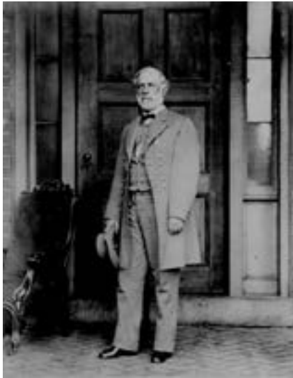
General Robert E. Lee.

the only tradition that seems to be apparent is the oppression of African Americans. Surely there is no honor in terrorizing children and denying them the right to an education.