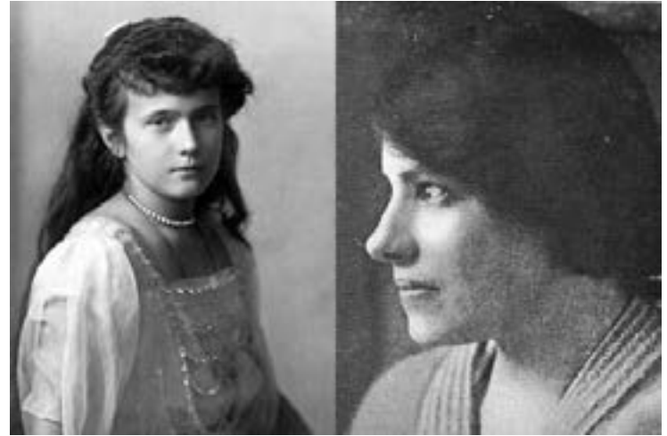
Left, Grand Duchess Anastasia. Right, profile photograph of Anna Anderson.

made Anderson’s story seem more legitimate. Much like a celebrity endorsement today, they made her claim seem more plausible to the general population and the media.