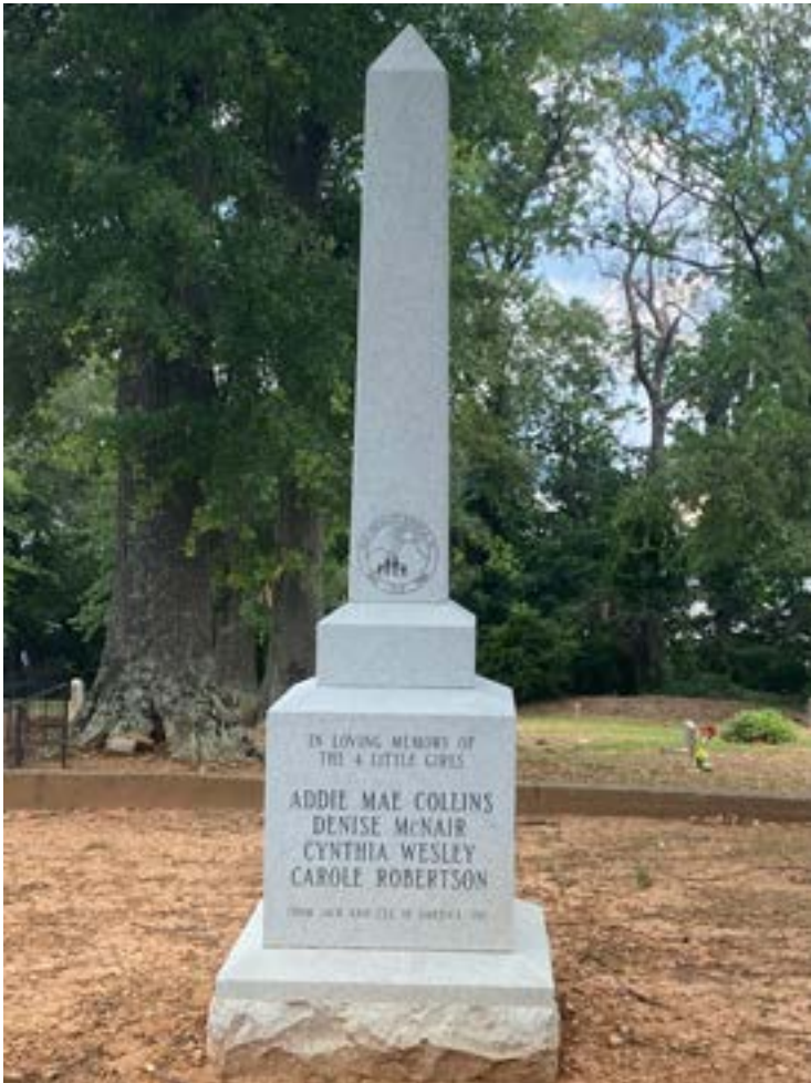
Monument to the four little girls killed in the 1963 bombing of the 16th Street Baptist Church, Greenwood Cemetery.