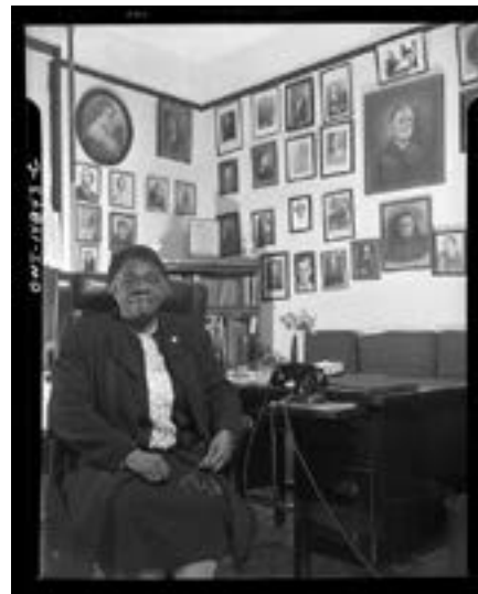
Dr. Mary McLeod Bethune, director of Negro Affairs for the National Youth Administration, January 1943.

progressive goals, such as establishing a minimum wage, developing the Civilian Conservation Corps and Social Security Program, and creating laws to regulate child labor and labor safety. 27 In her article “Social Security and Abroad,” she wrote that the Social Security program would be created “to protect our citizens from the hazards” that may result in “destitution and dependency.” 28 This would be one of many articles she would write that revolved around the issues she planned to address. Many of the programs and laws she helped develop were crucial components of New Deal relief efforts. She did all this while taking care of her daughter and husband, the latter of whom suffered from mental illness. 29