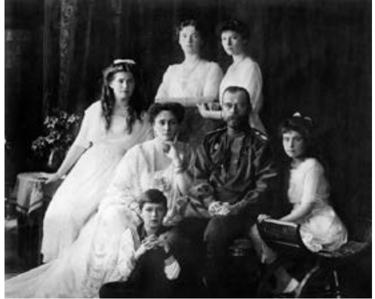
Russian Imperial family, circa 1913.

Conspiracy theories are important because of their political, cultural, and societal impact; because of their influence on pop culture; and because of how they affect people's emotional and mental states—both positively and negatively. New York Times writer David Brooks states that they have become, “the most effective community bonding mechanisms of the 21st century. For those awash in anxiety and alienation, who feel that everything is spinning out of control, conspiracy theories are extremely effective emotional tools...For those who feel powerless, they provide agency...they provide liberation.” 4 People often seek out conspiracy