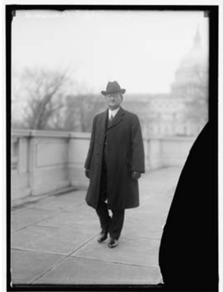
Senator Robert Foligny Broussard in 1914.

In 1910, the USDA completed a report on the widespread issue of splenic and Texas fever. In the “Twenty-Seventh Annual Report of the Bureau of Animal Industry,” the department explained that any animal who had contracted either disease should not be transported out of the state it resided in. The USDA continued,