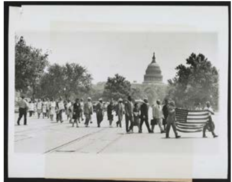
A group of African American people marching near the Capitol building in Washington, D.C. to protest the lynching of four African Americans in Georgia.