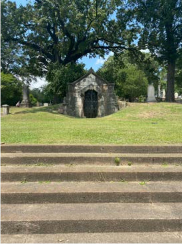
Mausoleum at Oak Hill Cemetery.

one of the most recognizable graves in Oak Hill. Many of the workers who labored at Sloss are also buried in this cemetery, which also contains a small collection of Freemason and veteran graves.