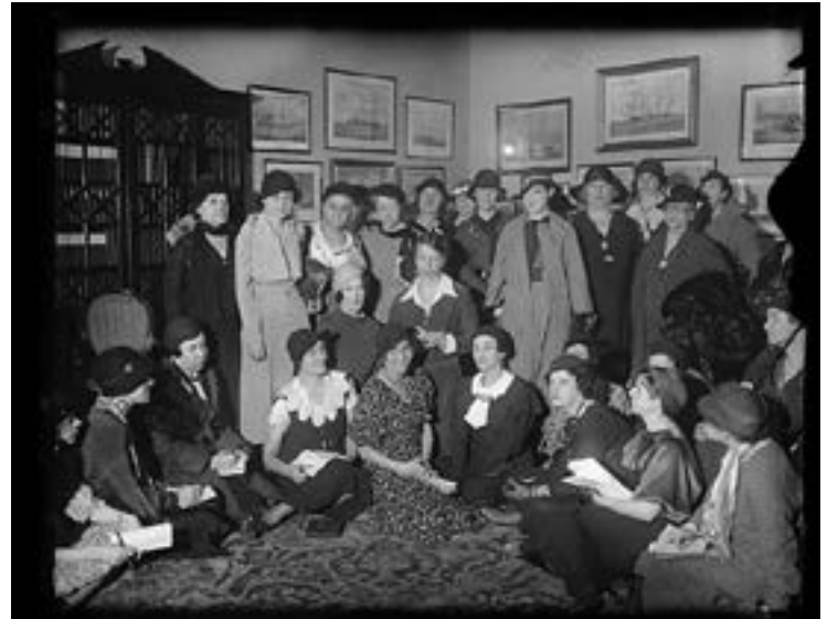
Eleanor Roosevelt, middle, not wearing a hat, congregating with a group of women in 1932 or 1933.

Eleanor Roosevelt, First Lady of the United States, was one of these female politicians with widespread influence and contributions. Her role as First Lady gave her “flexibility and freedom denied even to the president,” allowing her to take a proactive role in politics, which was unlike many of