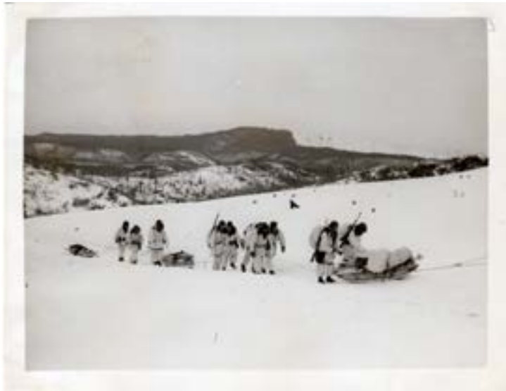
Members of the 8147th Army Unit team learning tactical warfare as they carried their weapons at the Winter Warfare School located in Hokkaido, Japan.