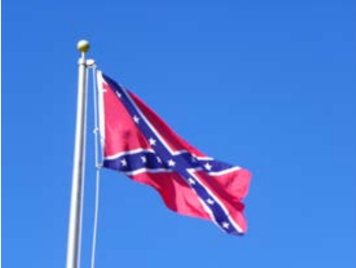
Confederate flag.

Throughout history, mankind has flown flags to show commitment and solidarity for their leaders and country. Flags are used to represent what is present and very much alive. Over time, flags change and their meanings evolve. They are used to lead men into battle, to drape the coffins of the dead, but most of all to show that an idea or nation still lives on. Recently, flags have become the center of attention for social movements. What some see as a piece of fabric reflecting the dominance of the majority, others see as a symbol of heritage and patriotism. Debates over flags occur across the world, but there seems to be no other flag that is more heavily debated than the Confederate battle flag. In the 150-year existence of the Confederate battle flag, it has been the face of injustice and suffering on a grand scale. What started as just a battle flag for the Confederacy during the Civil War has ended up outlasting both the war and the new nation. What should be viewed as a blemish and insult to the American people is often seen as the beloved relic of a