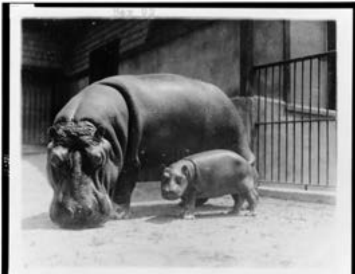
An adult and baby hippopotamus at the National Zoo, Washington, D.C., early 1900s.